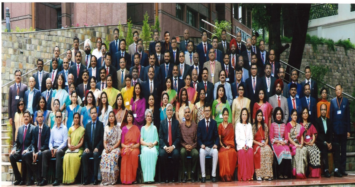
120 th Induction Training Programme for SCS- Validation