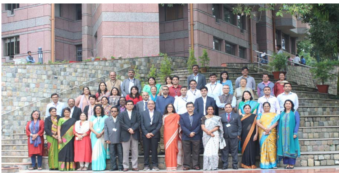
Group Photo of the Conference on Gender Budgeting