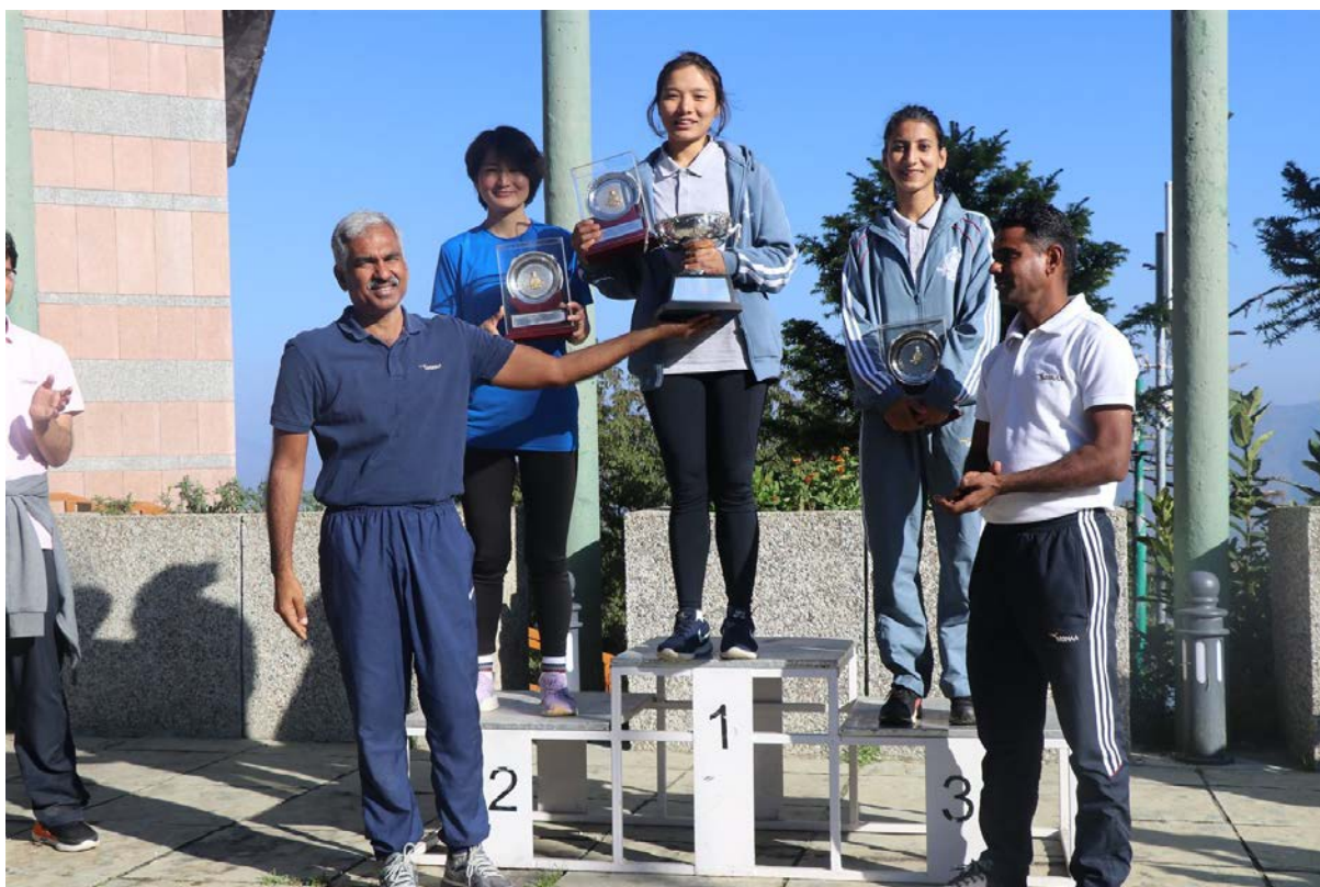
93rd Foundation Course-Cross-country Race