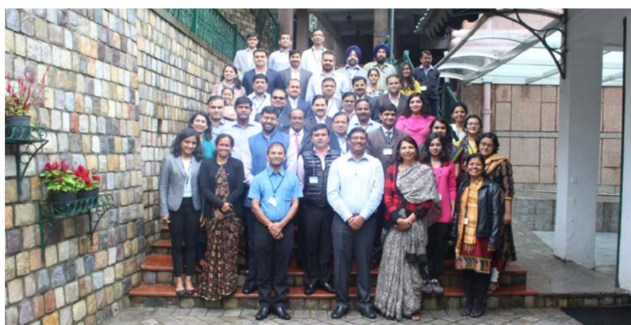
Group Photo of the Workshop on Stepping up to India's Nutrition Challenge: The Critical Role of Policy Makers