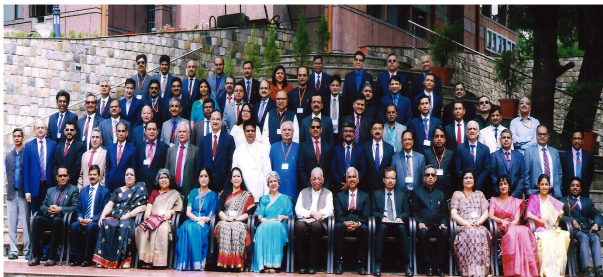
Participants of Phase-V (12th Round) of Mid-Career Training Programme

Each participant also wrote a policy paper and presented in small groups. The policy papers were evaluated by a panel of experts. The best 20 papers were shared with NITI Aayog as well as Ministries concerned. Awards were given to the three best papers.