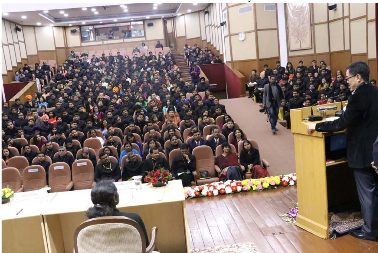
93 rd Foundation Course-Valediction