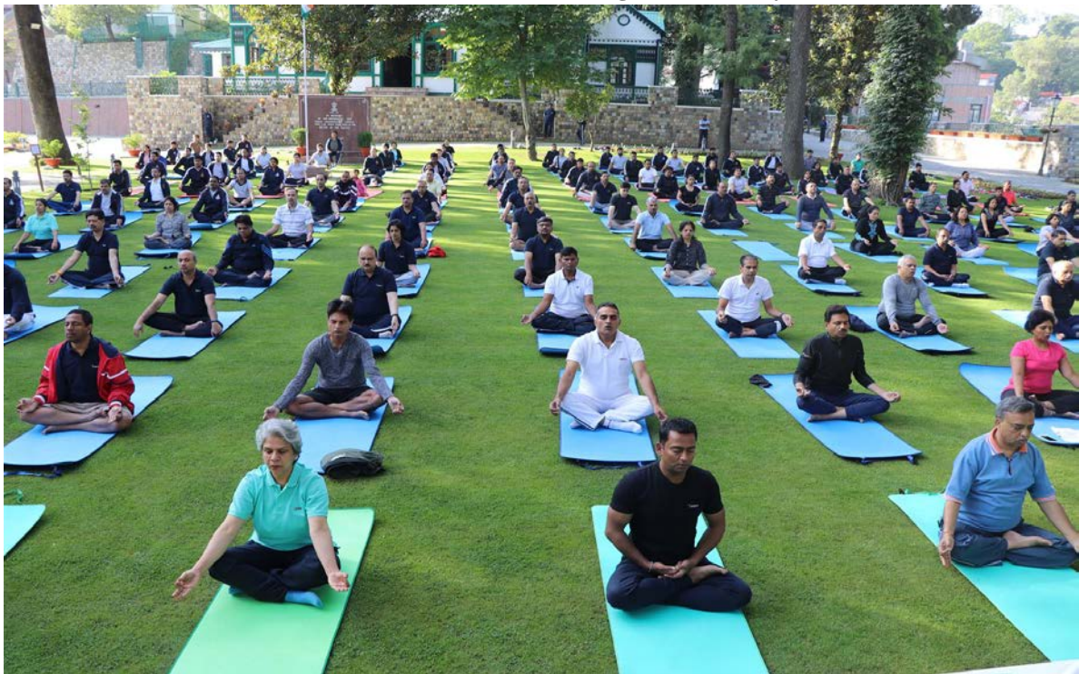
Yoga at the Academy on International Yoga Day on June 21, 2018