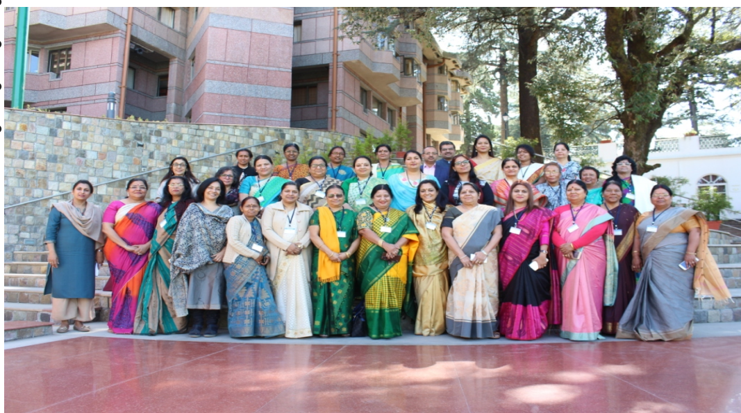
Group Photo of the Workshop for State Commissions for Women