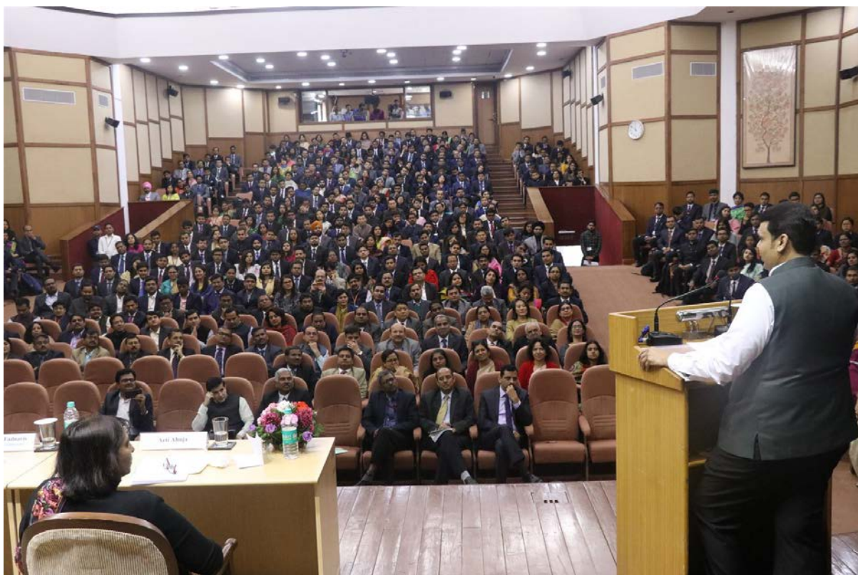
Mr. Devendra Fadnavis, Hon'ble Chief Minister of Maharashtra addressing Officer Trainees of 93rd Foundation Course at LBSNAA