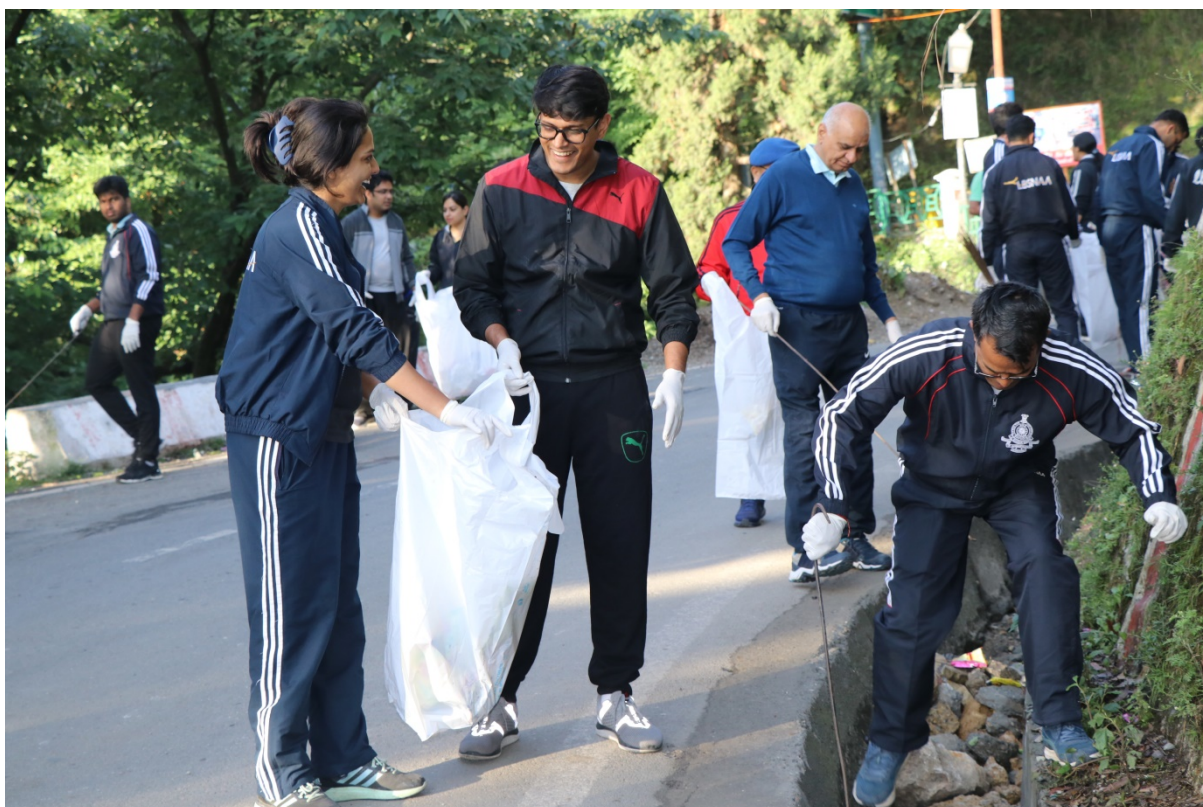
Officer Trainees in Shramdaan