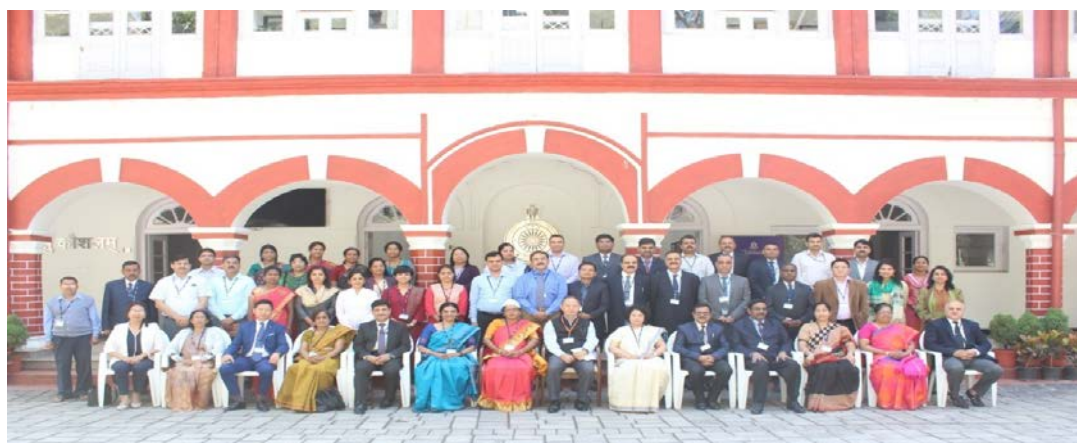
Group Photo of the Workshop on “Combating Violence Against Women and Children Conference on Gender Budgeting from 30 th July – 01 st August, 2018