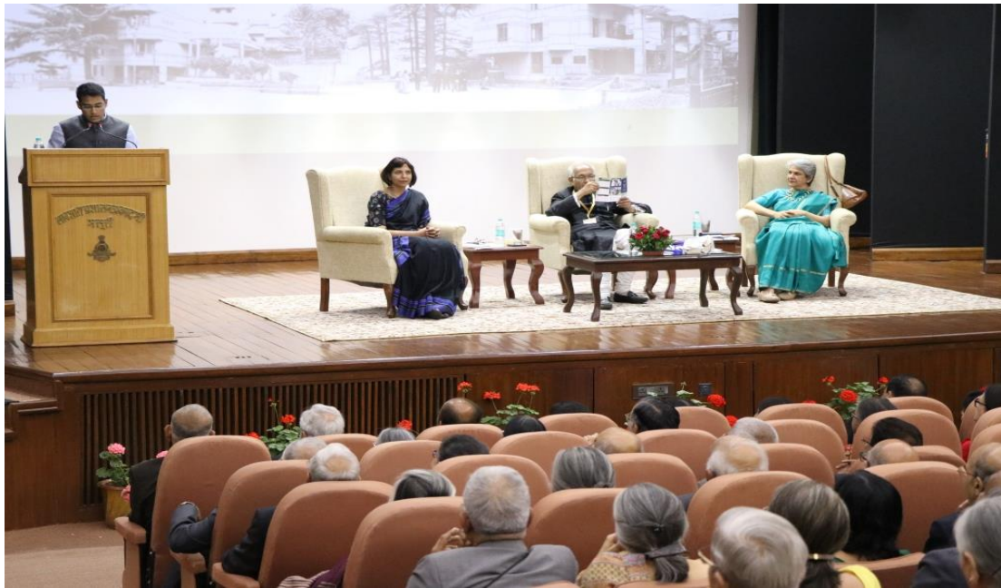
Participants of the Golden Jubilee Reunion of 1968 Batch