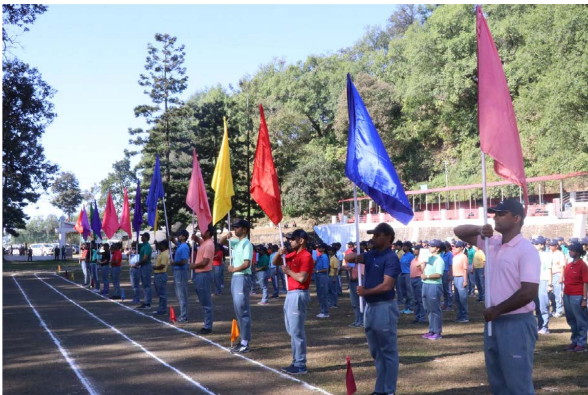
93 rd Foundation Course-Athletic Meet