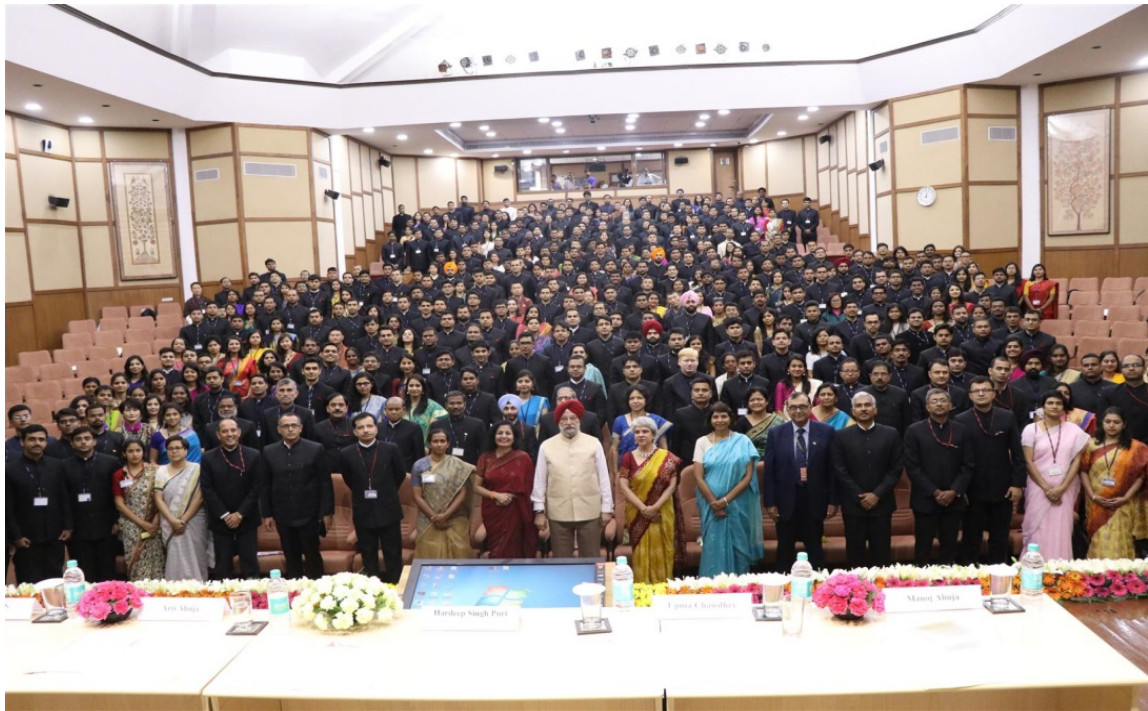
93 rd Foundation Course-Inaugural Ceremony