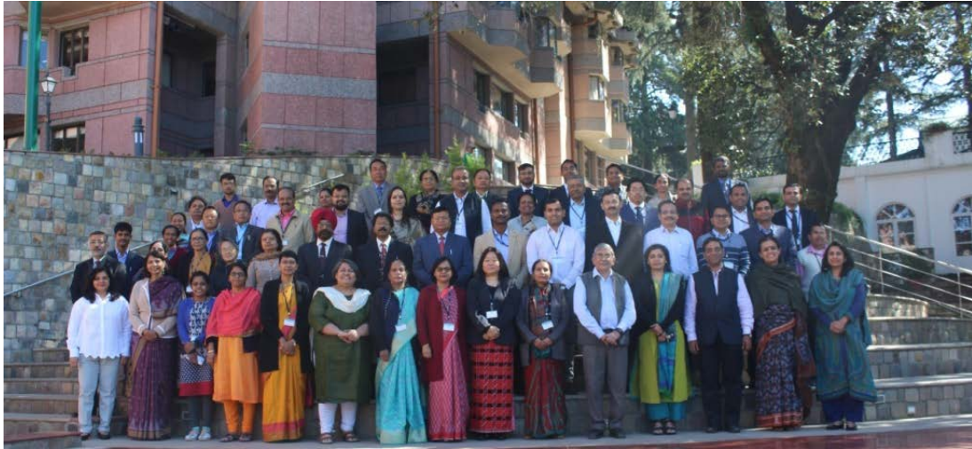
Group Photo of the Workshop on Early Childhood Development