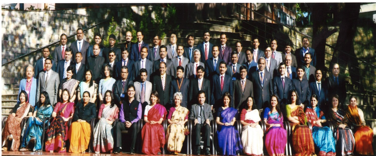
Participants of Phase-IV (13th Round) of Mid-Career Training Programme

In addition to mandatory morning activity every day the programme also included cultural programs, Shramdaan around Academy, sports and games with younger officers, Social service work, etc. The participants wrote a case study, Foreign Study Tour Paper and took a policy exam.