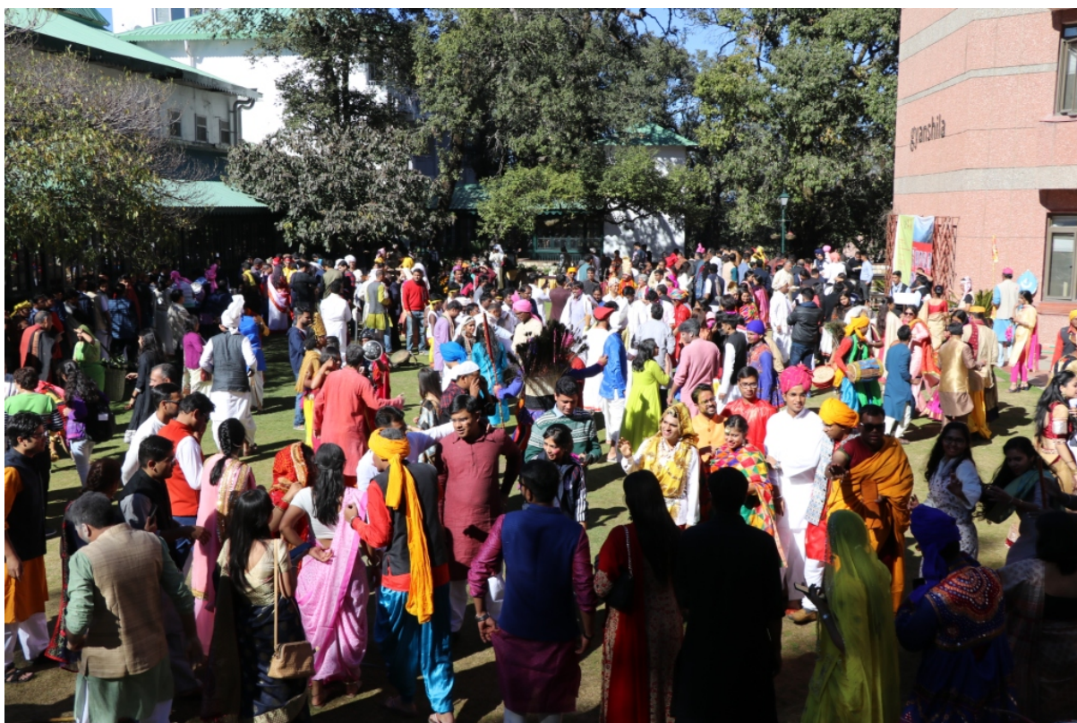
93 rd Foundation Course-India Day