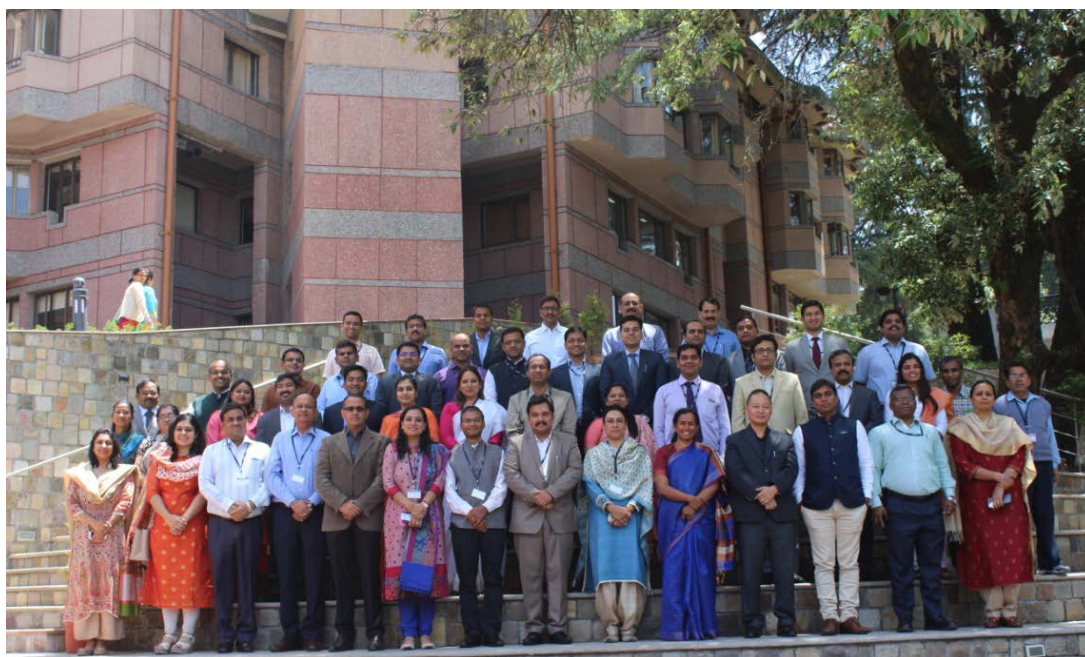
Group Photo of the Workshop on “Beti Bachao Beti Padhao Campaign” (BBBP).